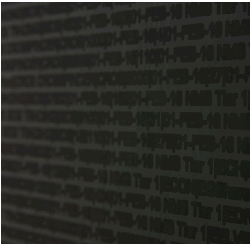
Detail of Dark Pools, Feb'16 A-Z, acrylic and screen print of canvas, 50 cm x 50 cm, 2016